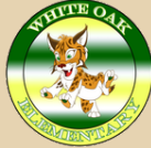
White Oak Elementary