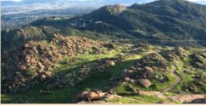
Santa Monica Mountains trail systems