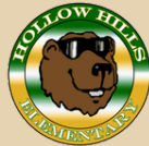
Hollow Hills Fundamental School