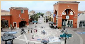
Neighborhood shopping centers